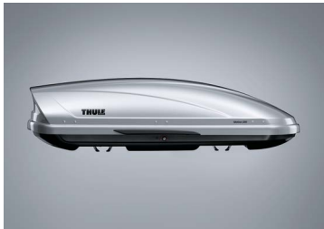
THULE MOTION M (200) ROOF BOX (SILVER GLOSS OR BLACK GLOSS) 1