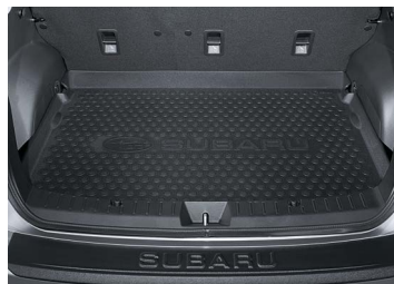
CARGO TRAY - HATCH