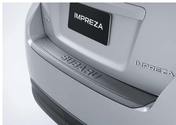
CARGO STEP PANEL - RESIN