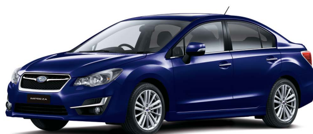
DARK BLUE PEARL