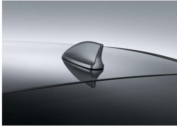
SHARK FIN ANTENNA