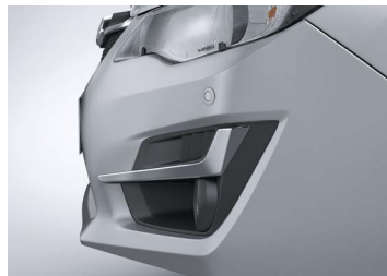
FRONT PARKING CORNER ASSISTANCE SYSTEM