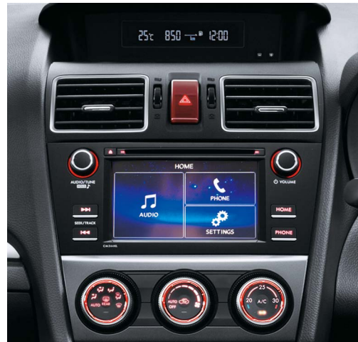
INTEGRATED INFOTAINMENT SYSTEM: Impreza 2.0i and Impreza 2.0i Premium