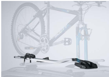
THULE SPRINT 561: ROOF MOUNTED / DIRECT FORK MOUNT 1