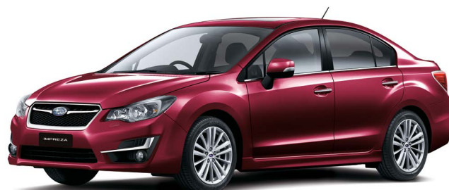
VENETIAN RED PEARL