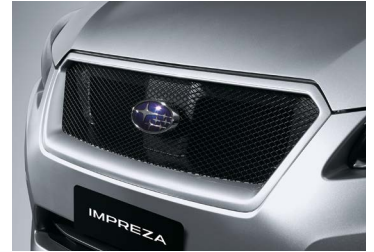
FRONT MESH GRILLE