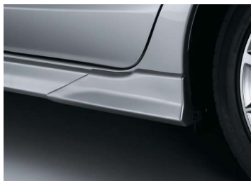
SIDE STRAKE (2.0i-S ONLY)