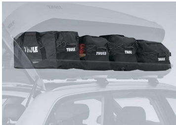
THULE GO PACK SET 8006 (X4 GO PACK BAGS FOR THULE ROOF BOX)