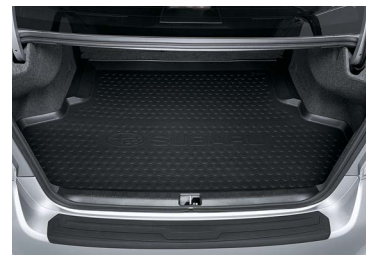
CARGO TRAY - SEDAN