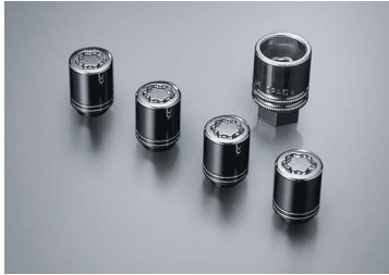
WHEEL LOCK NUTS