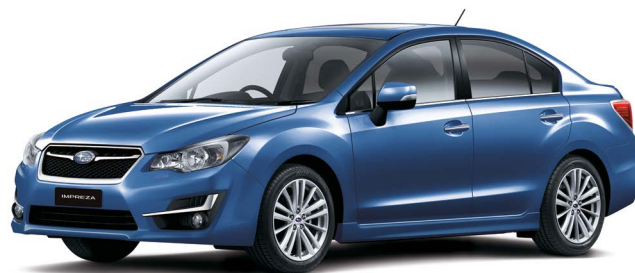
QUARTZ BLUE PEARL