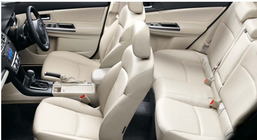
BLACK OR IVORY LEATHER: 1 Impreza 2.0i Premium and Impreza 2.0i-S