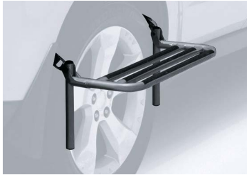
THULE STEP UP WHEEL STEP 232