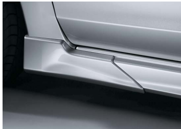
AERO MUD GUARD - FRONT (2.0i-S SEDAN ONLY)