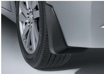
MUD GUARD SET