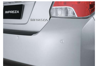
PARKING ASSIST (REAR)