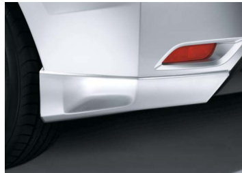
AERO MUD GUARD - REAR (2.0i-S SEDAN ONLY)