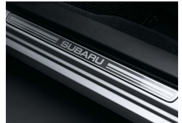
SIDE SILL PLATE