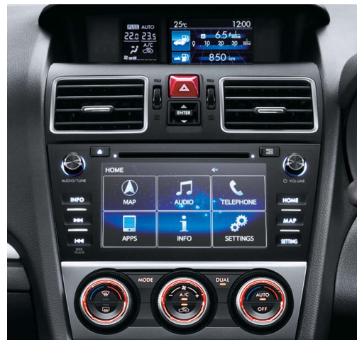
INTEGRATED INFOTAINMENT SYSTEM WITH SATELLITE NAVIGATION: Impreza 2.0i-S