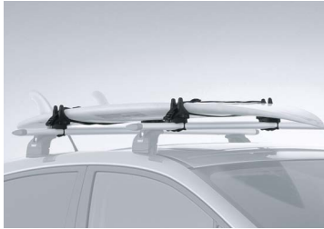
THULE WAVE SURF CARRIER 832 1