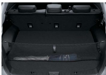
CARGO NET (REAR TAILGATE)