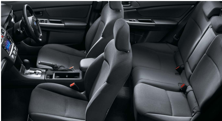
BLACK OR IVORY CLOTH: Impreza 2.0i