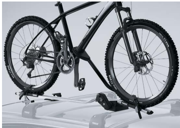
THULE PRORIDE: ROOF MOUNTED / RECOMMENDED FOR CARBON FRAMES 1