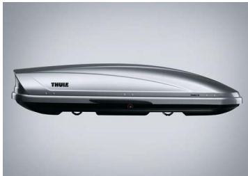
THULE MOTION XL (800) ROOF BOX (SILVER GLOSS OR BLACK GLOSS) 1