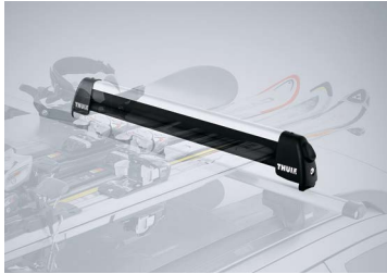
THULE DELUXE 727 SKI CARRIER (X6 PAIRS OF SKIS OR X4 SNOWBOARDS) 1