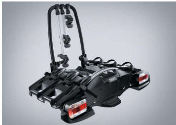
THULE VELOCOMPACT 927, 3 BIKE TOWBAR MOUNTED CARRIER 2