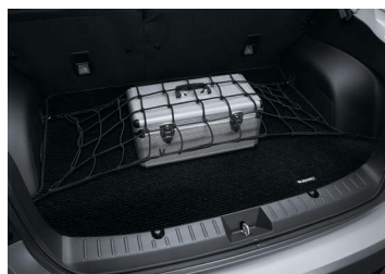
CARGO NET (FLOOR)