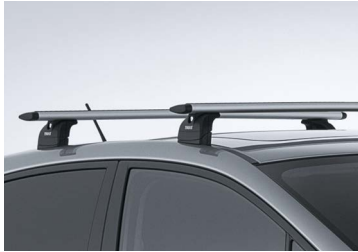
THULE WINGBAR / RAPID SYSTEM LOAD CARRIER FEET