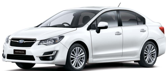
CRYSTAL WHITE PEARL

One of the final choices – but one of the most important! The colour you choose for your Impreza makes a bold statement about who you are. So we've made sure you've got lots of ways to express yourself – with a wide range of colours to make your Impreza more... you.