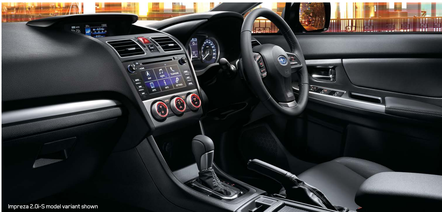
Impreza 2.0i-S model variant shown