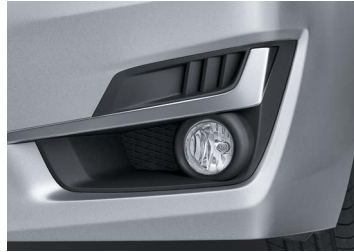
FOG LAMP KIT