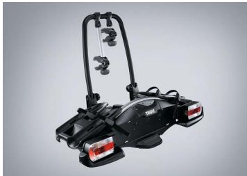
THULE VELOCOMPACT 925, 2 BIKE TOWBAR MOUNTED CARRIER 2