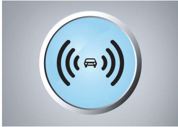
SECURITY ALARM SYSTEM