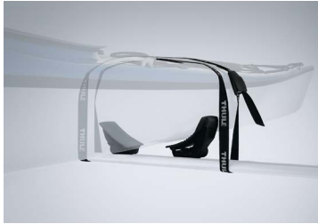
THULE KAYAK CARRIER 874 1