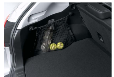
CARGO NET (SIDES)