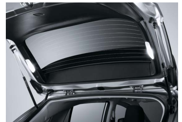
REAR HATCH LIGHT