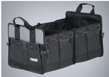
THULE GO BOX